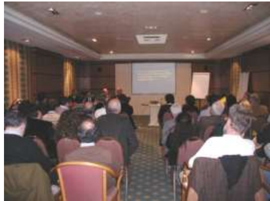
Panel and Audience at Study Club Meeting